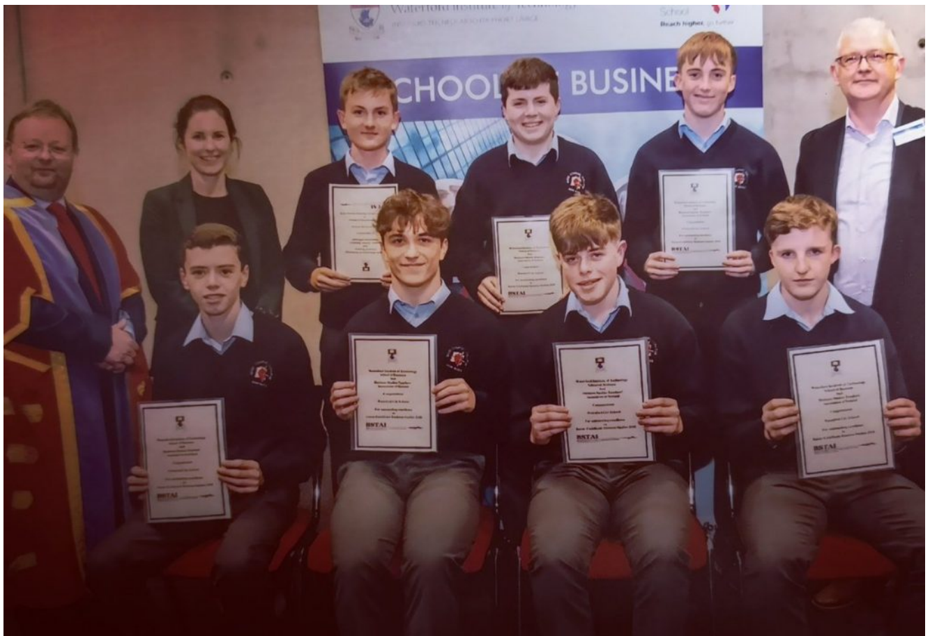
Boys who achieved an 'A' Grade in Junior Certificate Business receiving their Certificates of Acknowledgement from Waterford IT and the BSTAI.