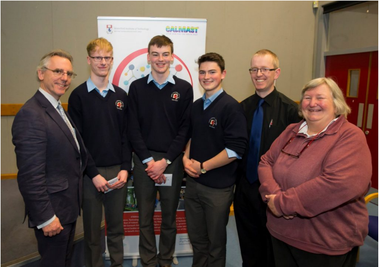
Winners of the ISTA South East Regional Senior Science Quiz in WIT during Science Week.