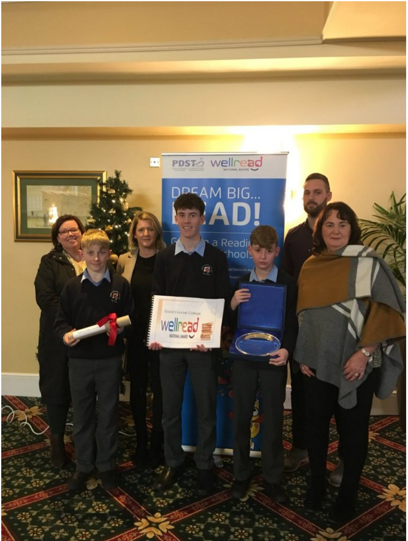
Our Wellread Team collecting our Award. Parents, teachers and students.