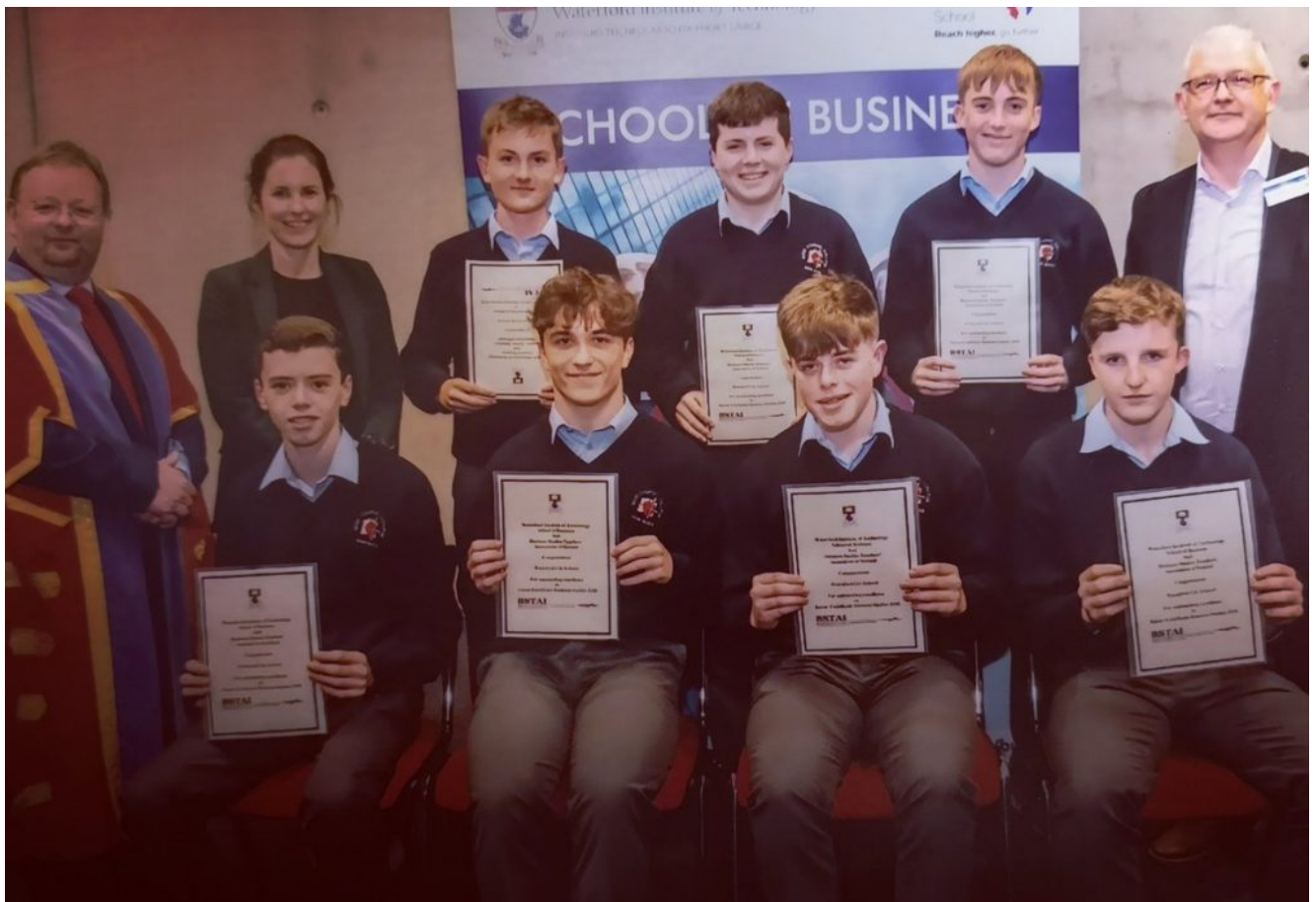
Boys who achieved an 'A' Grade in Junior Certificate Business receiving their Certificates of Acknowledgement from Waterford IT and the BSTAI.