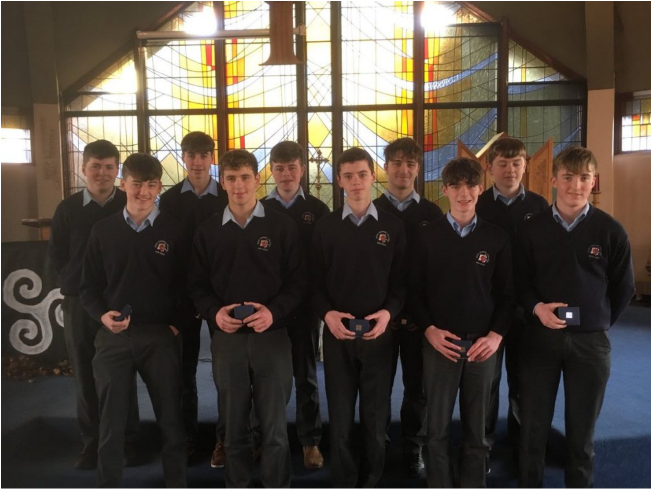
In house awards for exceptional performance in Junior Certificate including one student who achieved 10 A Grades at higher Level and a Distinction in English HL.